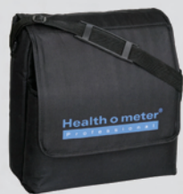
Carrying Case for 349KLX Item# 64771