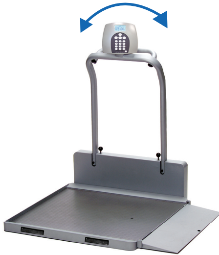
180° Swivel Display