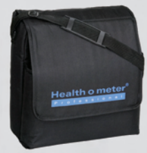
Carrying Case for 822KL Item# 64771