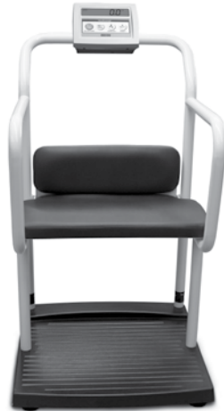
Bariatric/Handrail with Chair Seat Model 240-10-1