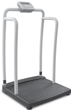
Bariatric/Handrail Model 240-10-2