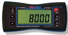
Compatible with Optional MSI-8000 RF Remote Display