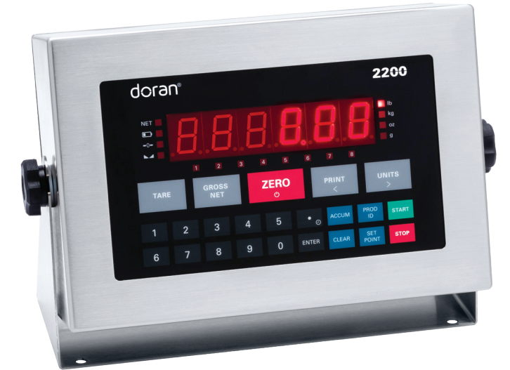
Indicator with U-Bracket

The system supports operators in maintaining performance goals and achieving production efficiencies. A large bright 1" LED display and responsive full numeric keypad make the 2200 easy to operate, even when wearing gloves or in low-light conditions. Scroll to use scale in lb, oz, lb:oz, g, or kg. Then, simply enter the desired value with the full keypad, press one of the clearly labeled function keys, and the data is entered.