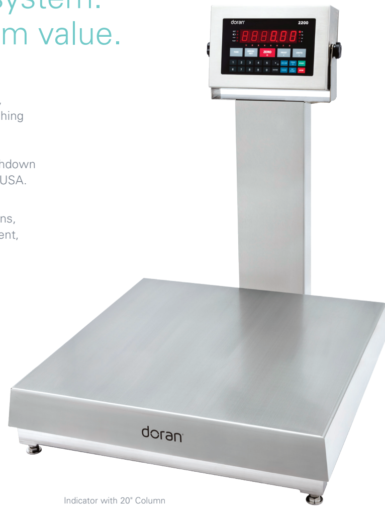
Indicator with 20" Column and DSS Series Scale Base

The result is a turnkey solution that delivers greater efficiency, lower ingredients costs, and reduced bad batches.