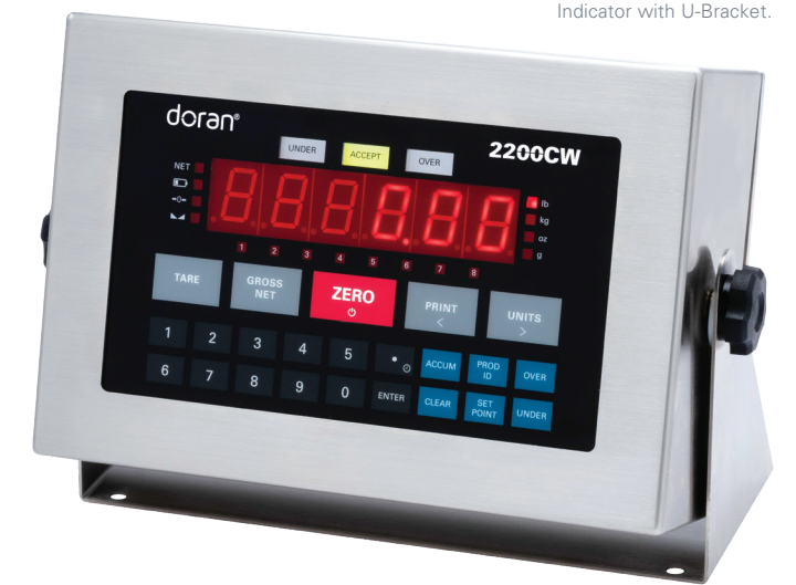
Indicator with U-Bracket.

Prompts and process control for measuring ingredients and ensuring user-defined tolerances are met for each ingredient every time. An auto learning setpoint feature compensates for changing process inputs and the system can interface with existing load cells. The 2200CW provides precision measurements from .01g to 100,000 pounds