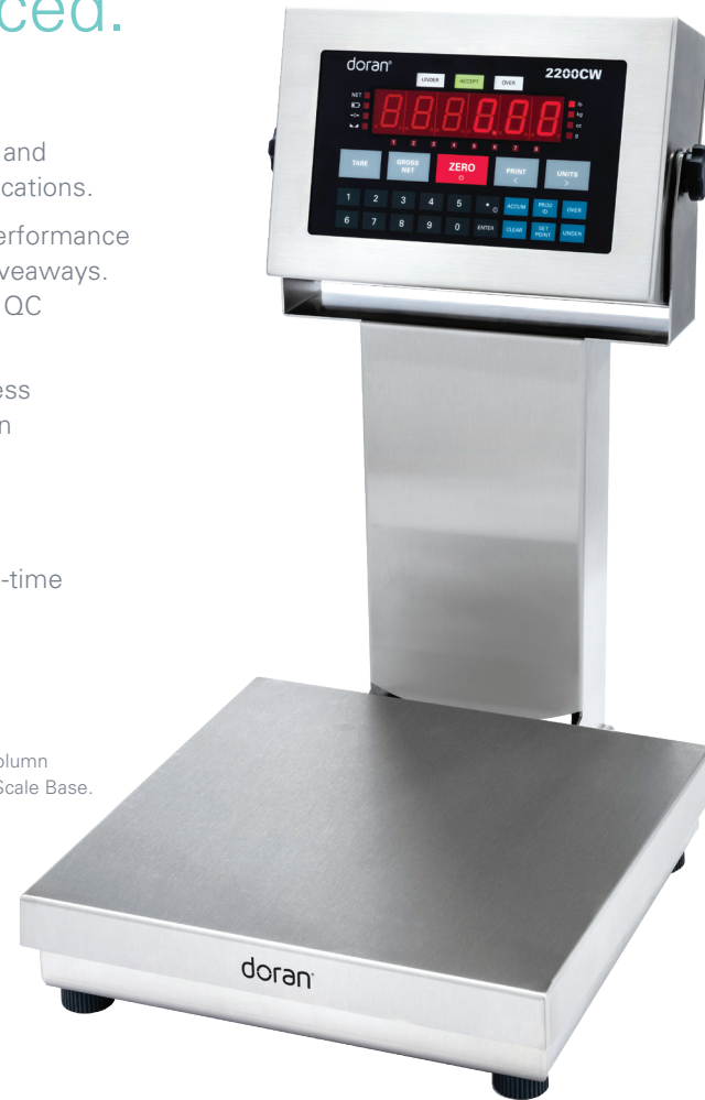
Indicator with 14" Column and DXL Series SS Scale Base.

A large selection of Doran power options, scanners, and communications and networking equipment, and other accessories. Plus, add Doran ionSuite™ software for real-time data collection and efficient production.