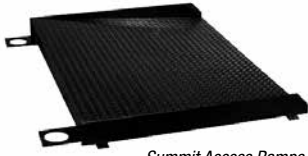
Summit Access Ramps