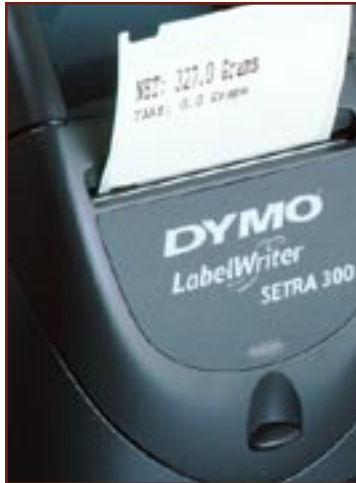
Dymo™ Labelwriter SE300 Thermal Printer

The Himalaya Series of single range balances combines versatility with very high readability. The six button keyboard affords great flexibility by allowing a choice of several weighing modes. In addition to measurements in units of grams, ounces and carats, each HI balance can display weight as a percentage for use in checkweighing and as grams per second to monitor flow rates. A user defined unit can be programmed for any unit of measure, such as ml for measuring volume and $ for measuring value. The MODE key may be used to select either a fast or slow display update rate. This key can also be used to lock in a displayed weight, a feature which is useful in continuous weighing applications. The PRINT key may be set to transmit data immediately, continuously, or at selected time intervals.