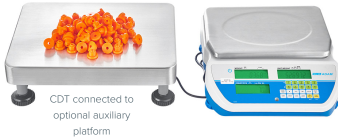
CDT connected to optional auxiliary platform