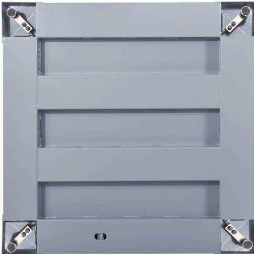
Wide channel design for superior durability