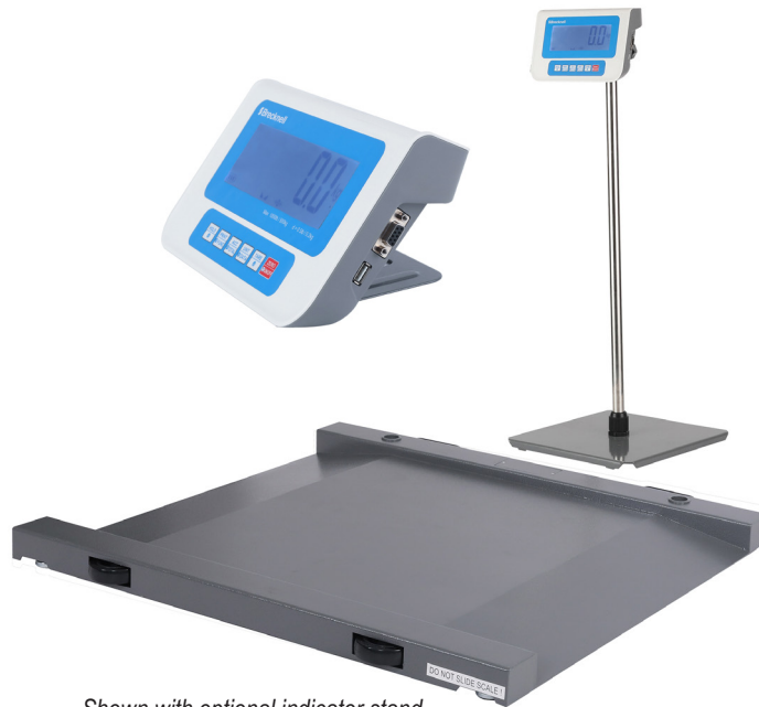
Shown with optional indicator stand

DS1000-LCD Drum Weigher Scale is ideal for any busy shipping area where goods are constantly being moved around by pallet jacks or for monitoring drum weights.