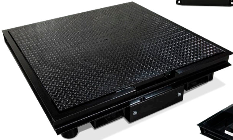
Scale is sold separately

Forklift SENDit Portability Frames, Non-NTEP