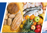
Food and beverages

The products and solutions presented in this data sheet make major contributions in the following sectors: